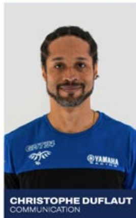
CHRISTOPHE DUFLAUT COMMUNICATION