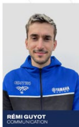
RÉMI GUYOT COMMUNICATION